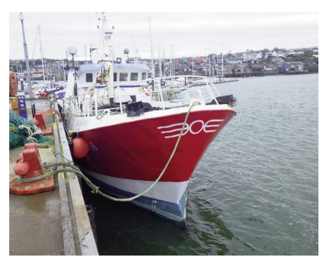
Breizh Arvor II alongside in Kinsale, County Cork

Note: Times are local time = UTC + 1 (Co-ordinated Universal Time + 1)