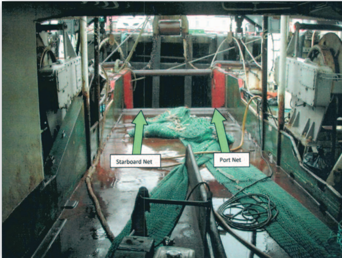
Appendix 9.5 Photo of Trawl Deck Showing Nets.