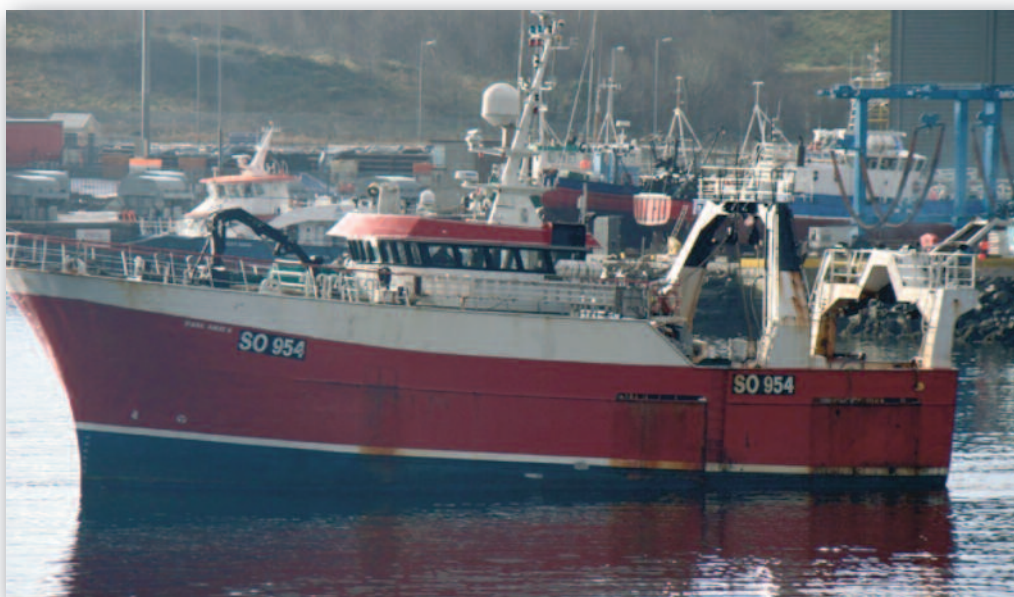
MFV 'Mark Amay II'