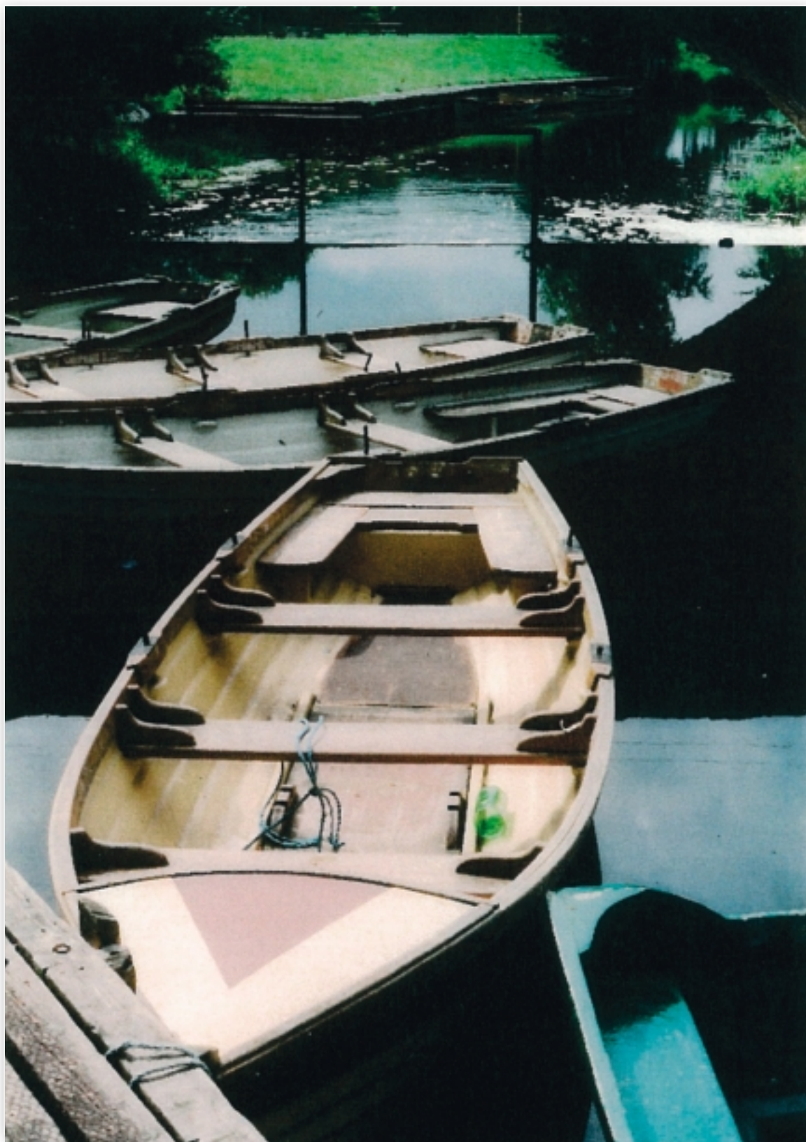
Appendix 8.1 Photographs of the boat.