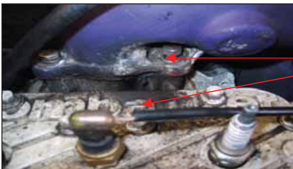
Figure 5. Engine and exhaust manifold

Exhaust damage due to loose retaining bolts