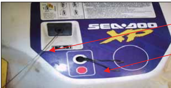
Figure 4. Consol