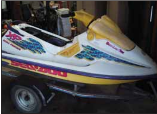
Figure 1. Seadoo