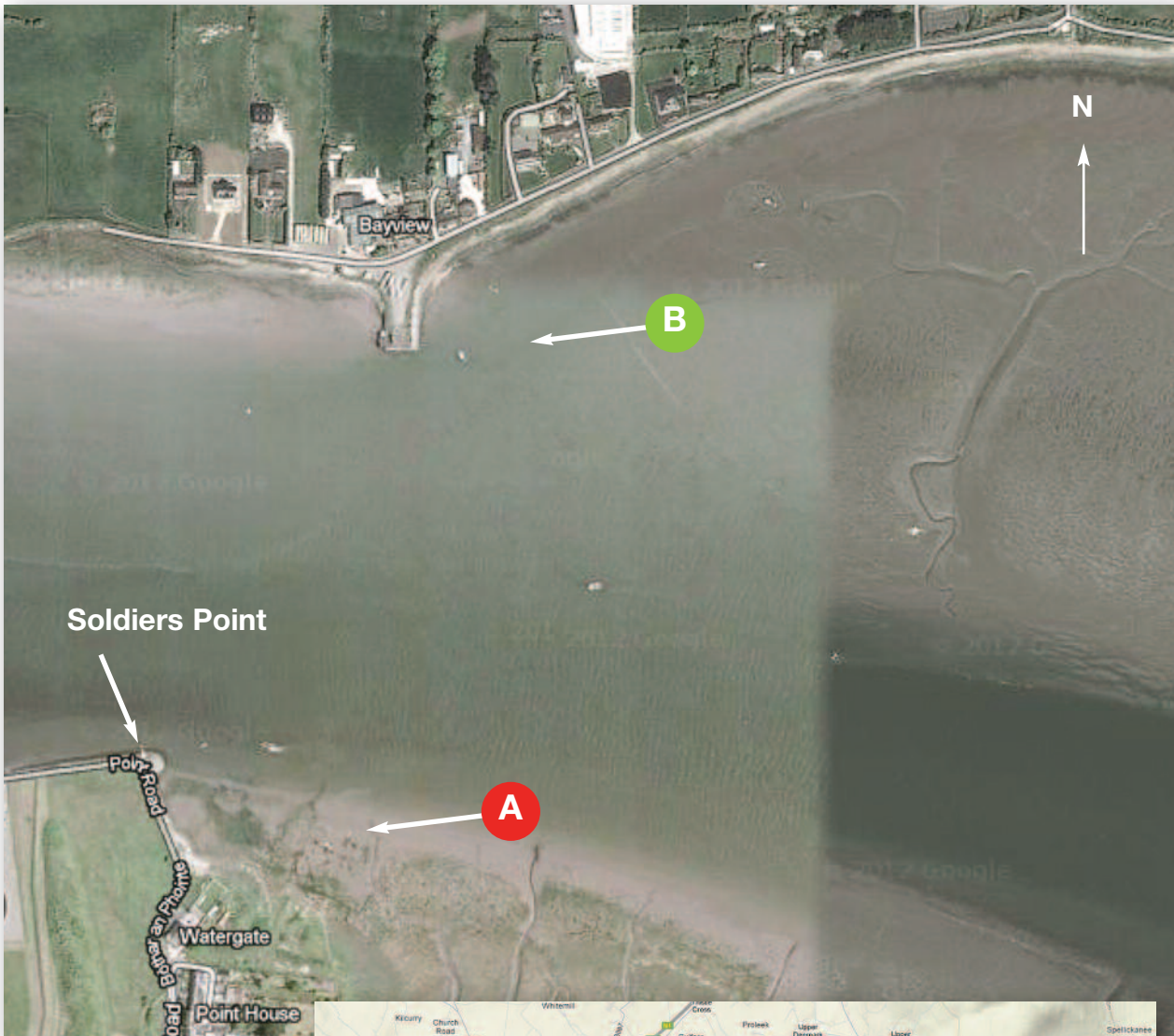
Appendix 7.3 Aerial view of incident site in Dundalk Estuary.