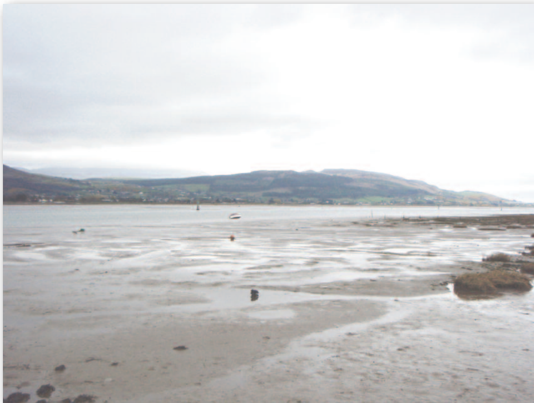
Photo of the mudflat on the southern shore of Dundalk estuary at low tide taken on 06/04/2012. This is approximately the location from which Mr Fergus would have walked out to the small punt and then proceeded out to his boat. Mr Fergus's boat can be seen in the distance across the mudflat.