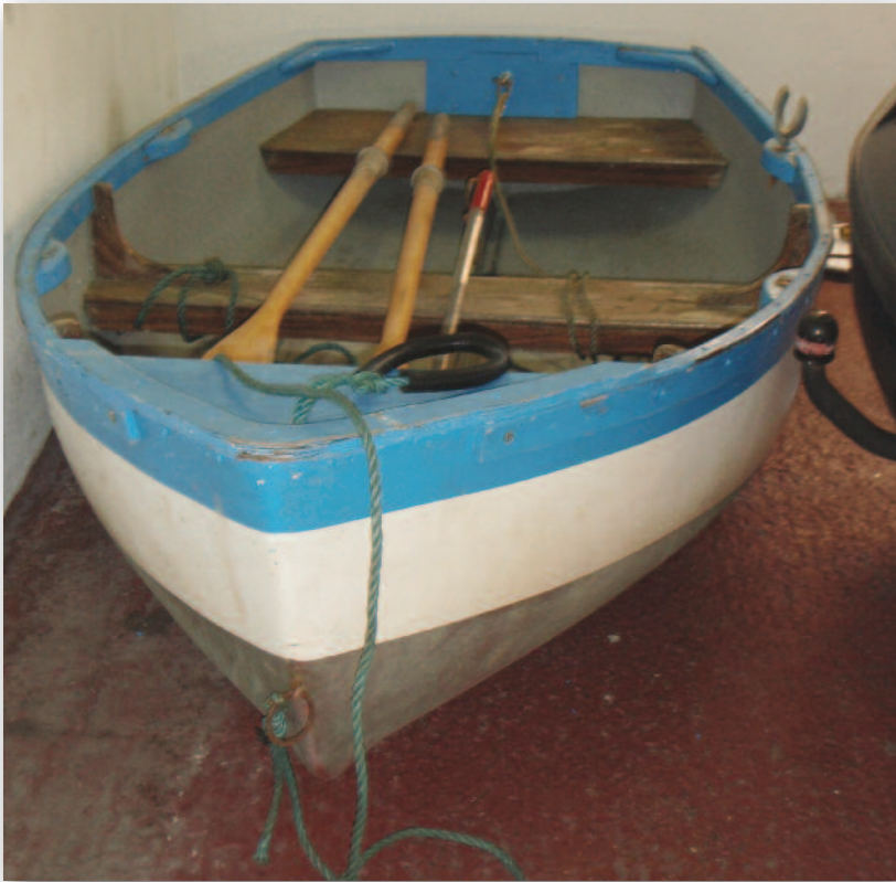
Appendix 7.1 Photographs of the punt.