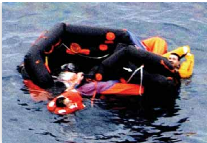
Appendix 8.1 Photographs of the incident.