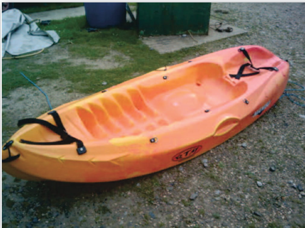
Appendix 9.1 Photo of similar kayaks.