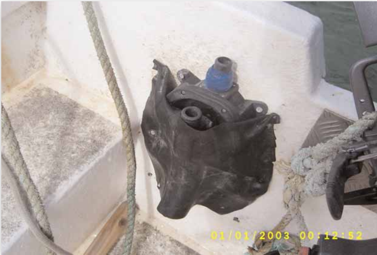
Appendix 8.4 Photographs of boat.