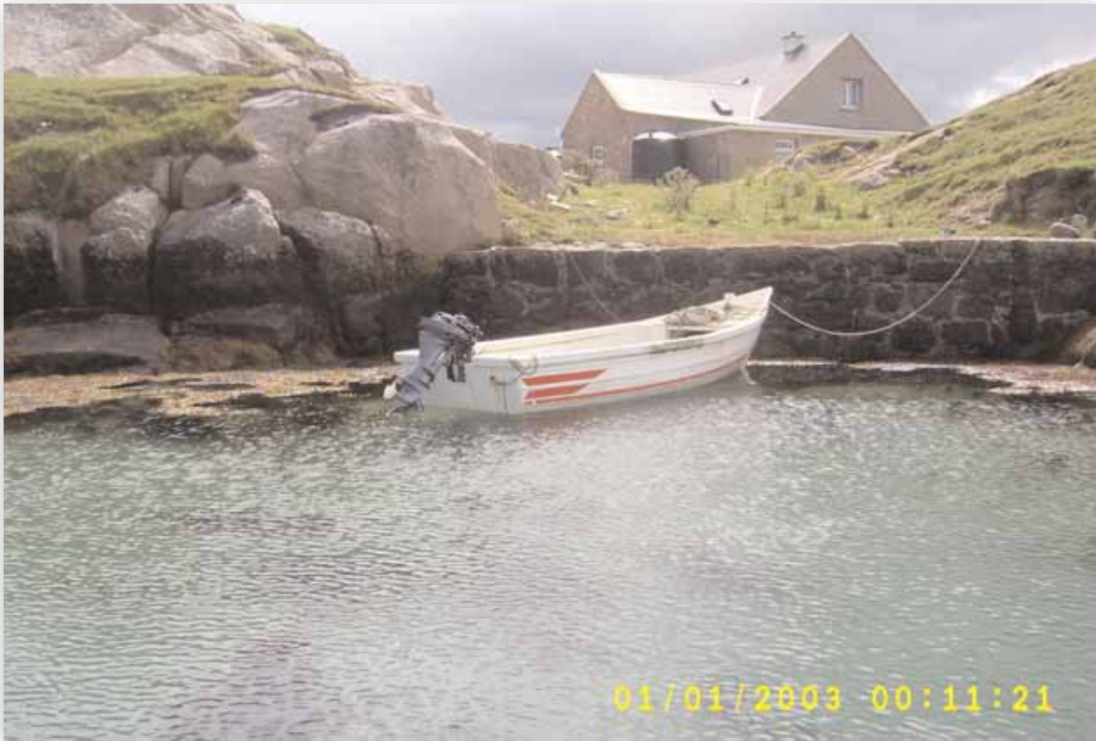
Appendix 8.4 Photographs of boat.