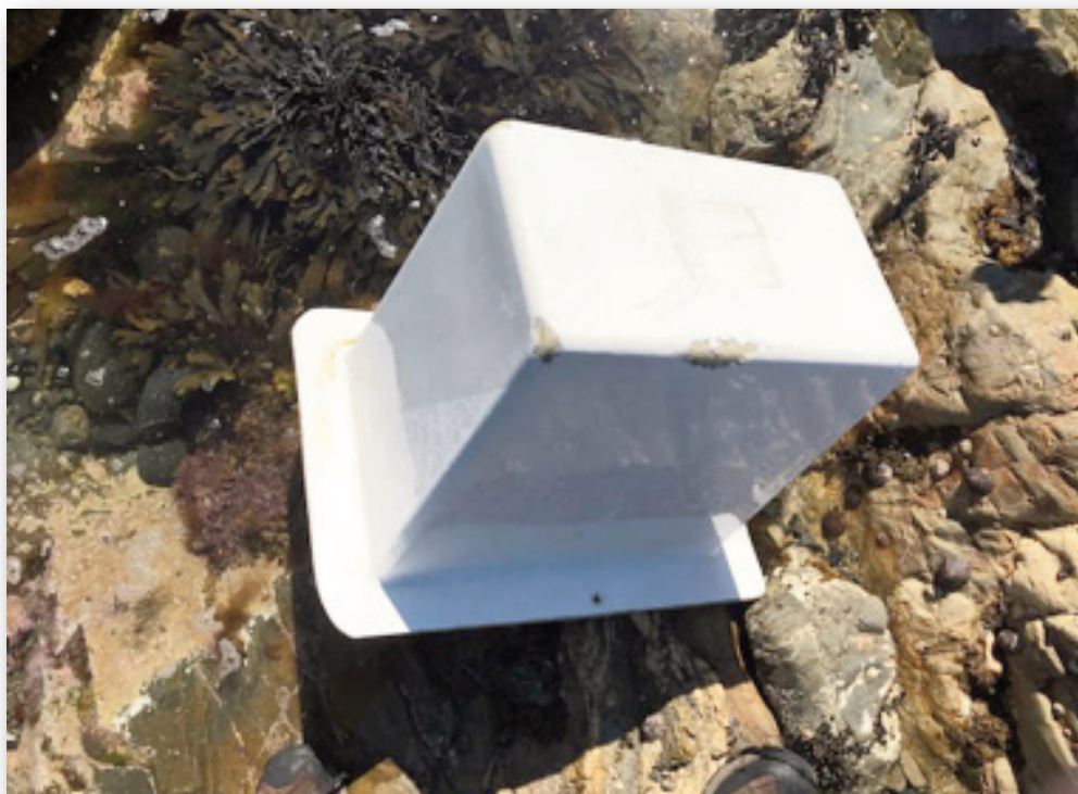
Photograph No. 9: Extra centre seat found in debris field.