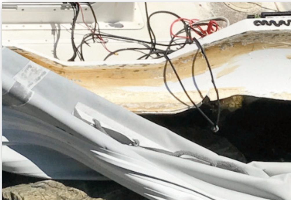
Photograph No. 3: Aft port tube torn away from hull.