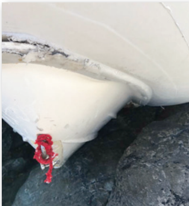
Photograph No. 7: Rigid hull damage.