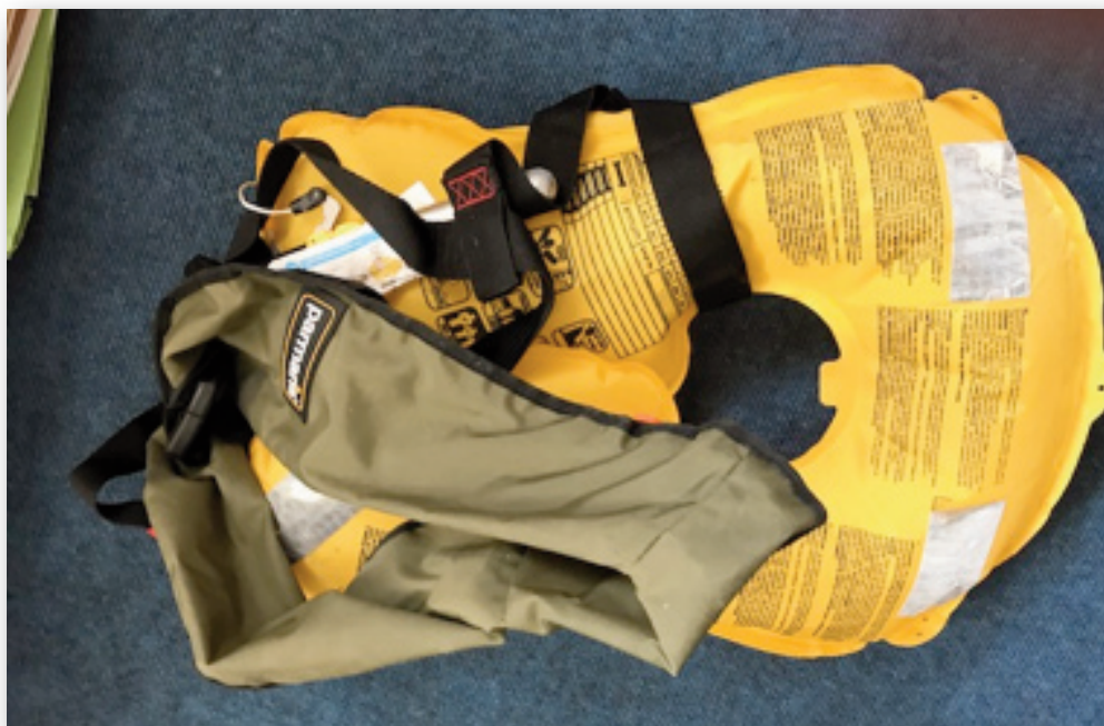
Photograph No. 1: PFD recovered in debris field.