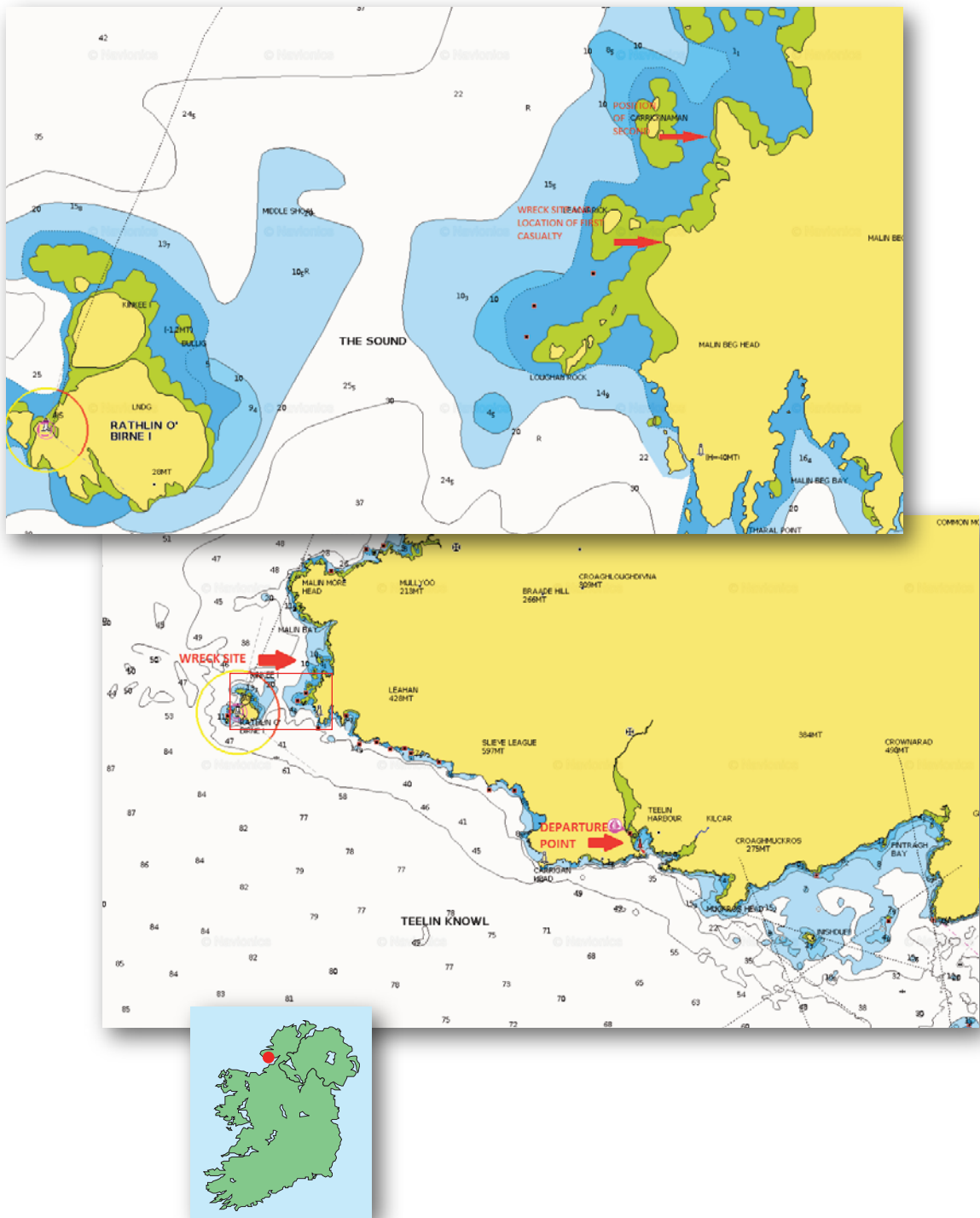
Appendix 7.2 Chart of incident area.