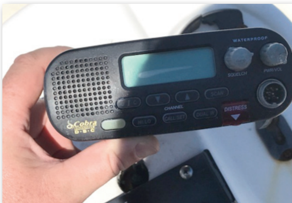
Photograph No. 8: VHF without hand held microphone.