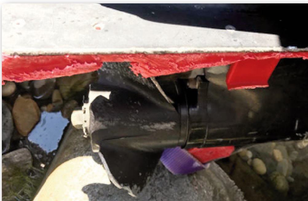
Photograph No. 6: Propeller blades damage.