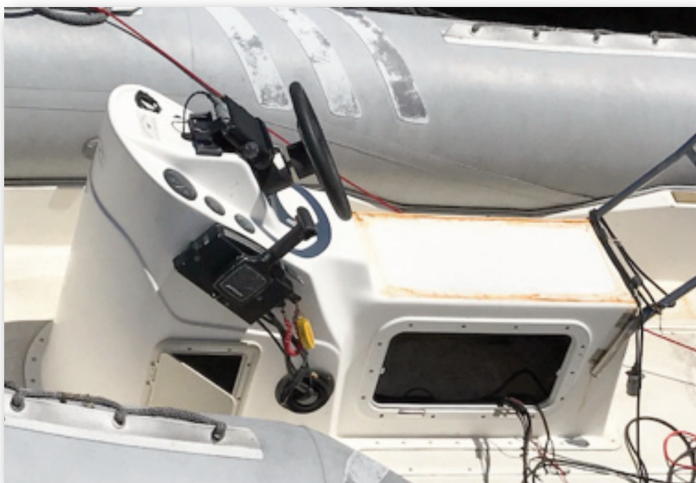
Photograph No. 4: Battery cover in console broken out.