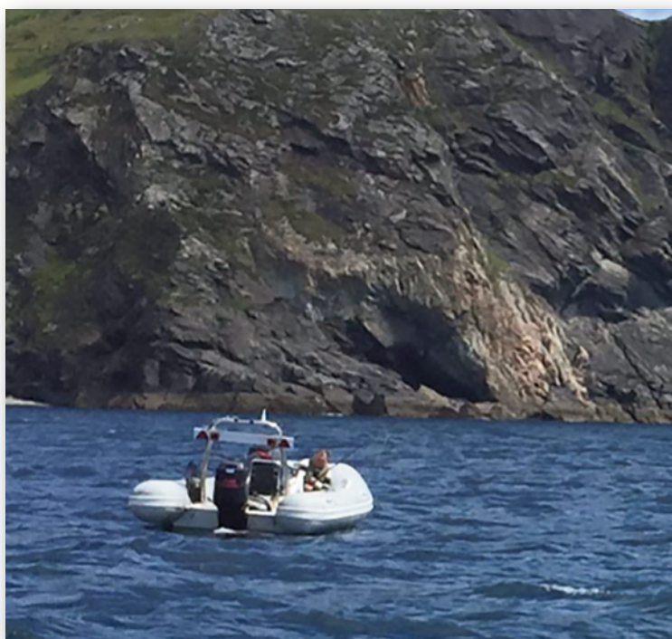
Photograph No. 10: Photo of the men fishing.