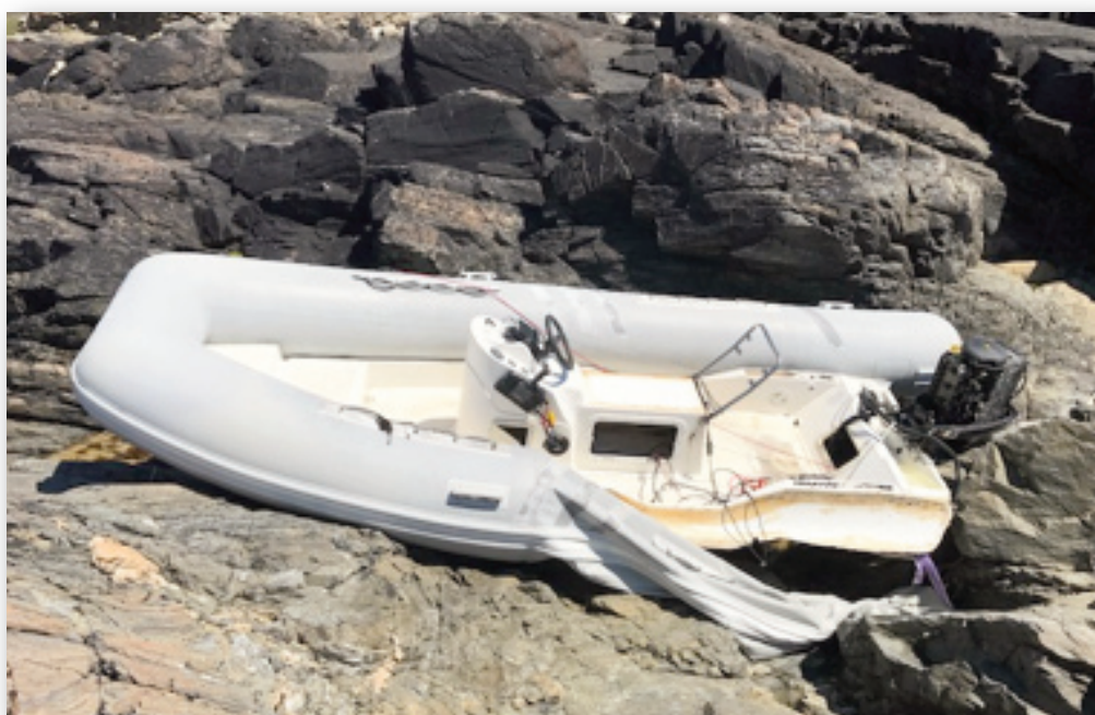
Photograph No. 2: Vessel as found after the incident.