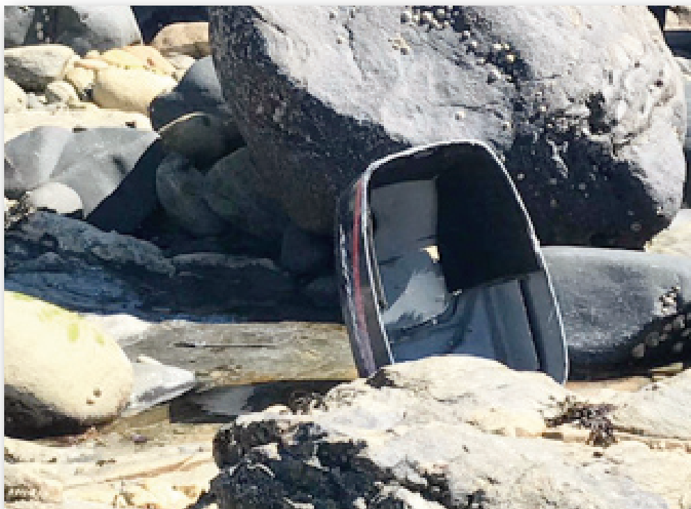
Photograph No. 5: Engine cover in debris field.